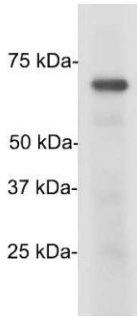
Image: Blots of crude HeLa cell homogenate blotted with TAF15. The monoclonal antibody binds strongly and cleanly to a band at about 68 kDa.